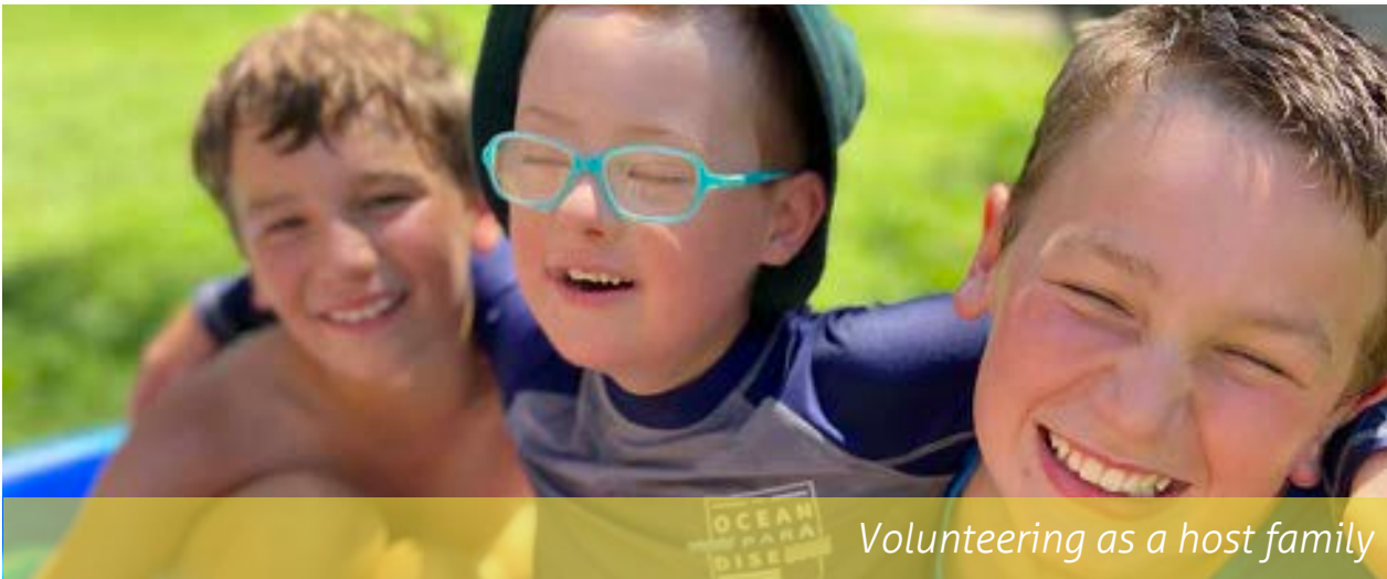
Volunteering as a host family

Our administration department comprises a wide range of tasks and skill sets. If you are skilled and interested in volunteering in the following areas; marketing, media, accounts, IT, OH&S, recruitment, training, data entry or any general office duties, we can explore volunteering possibilities with you.