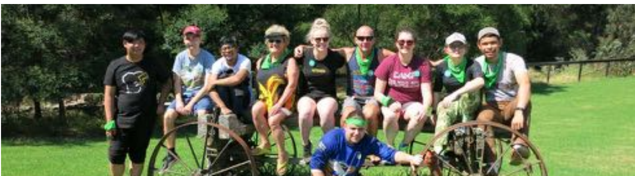
Volunteers are the essence of Family Camp

The highlight of the Interchange Outer East calendar, Family Camps and days are a wonderful and unique opportunity for the whole family to relax and spend time together in a supportive environment with assistance from staff and volunteers. Generally two family camps are held per year, with one aimed at families who are new to Interchange Outer East. The Interchange Outer East Family Camp Program was named as a finalist in the 2017 Victorian Disability Awards under the category 'Excellence in Promoting Health, Housing and Wellbeing'.