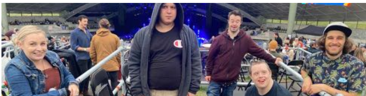
Live music with Adult Rec