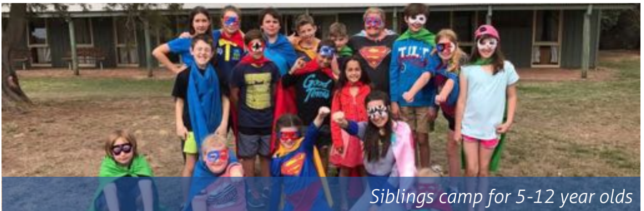
Siblings camp for 5-12 year olds

Many grandparent carers face issues of social isolation, physical and emotional exhaustion, difficulties navigating the sector and sourcing information and support to assist them in their caring role. The program offers social opportunities to meet with other grandparent carers, attend activities with the children in their care, information sharing and workshops.