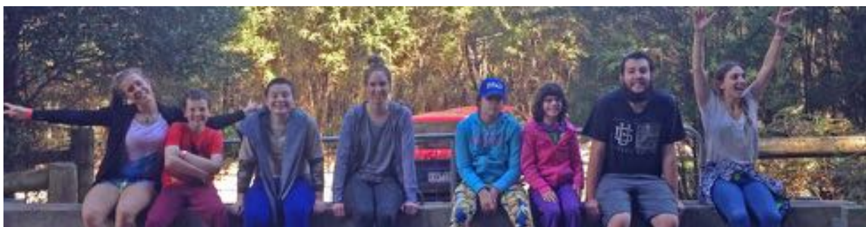
10-13 Recreation explore the Warburton Redwood Forest

Note: Because of our innovative and responsive approach to service delivery, we offer a range of new and developing programs throughout the year. These are usually advertised on the IOE website, monthly e-newsletter and Facebook page.