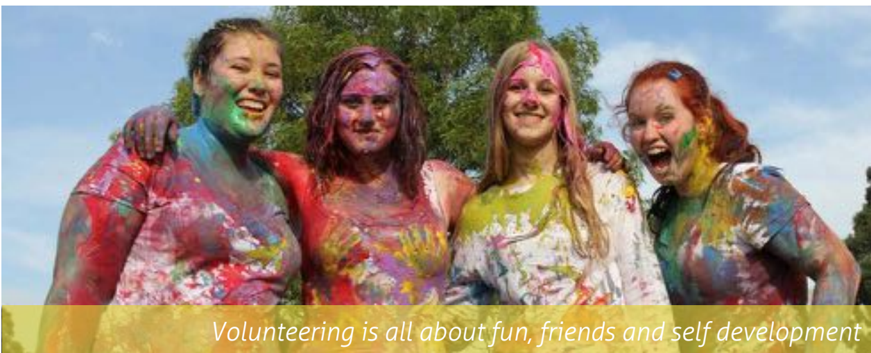
Volunteering is all about fun, friends and self development