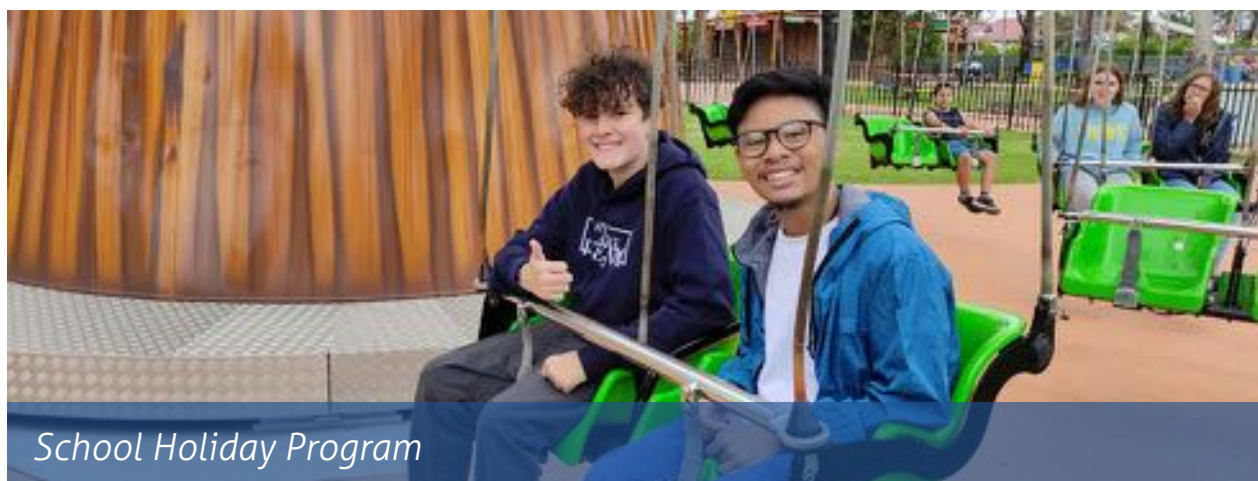
School Holiday Program