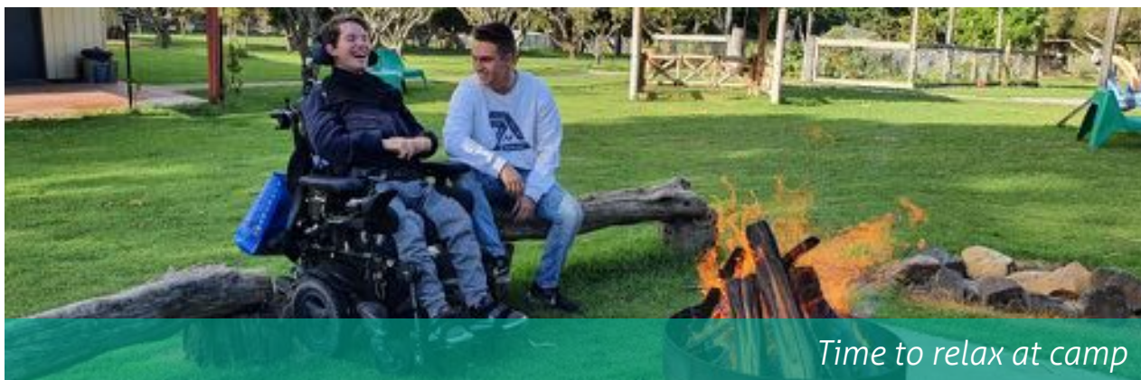
Time to relax at camp

Boys2Men and Girls2Women: These are six month (approx.) small group skill development programs focusing on the transition from teenager to adulthood. Facilitated by experienced staff who are excellent role models, with some support from external professionals, groups explore a range of different topics. Now also offering a five day camp program option. For people aged approx. 14-25 years.