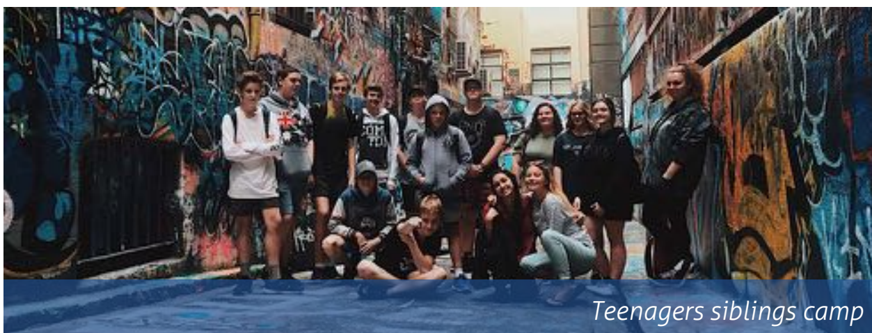
Teenagers siblings camp

Central to every behaviour support plan is a comprehensive assessment of behaviours for the formulation of individualised strategies and responses. This service must be included in the participant's NDIS plan and is funded under Capacity Building; Improved Relationships.